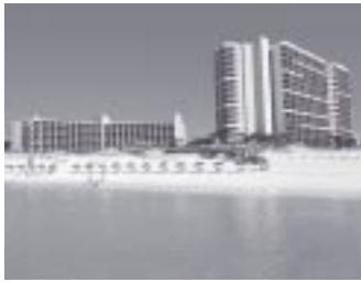
Sandestin Hilton Hotel, Destin, FL